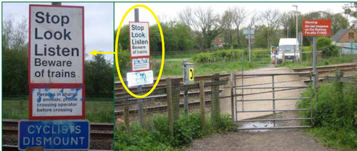
Figure 4: Signs on up side of line