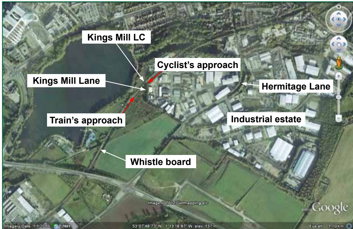
Figure 2: Aerial view of Kings Mill crossing and surrounding area