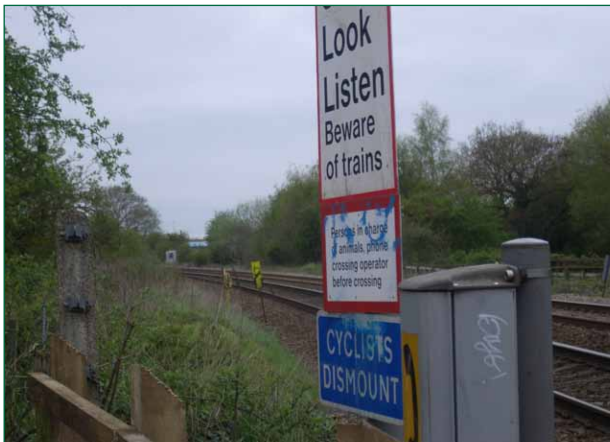
Figure 5: View from up side of crossing looking south-west (towards down trains)